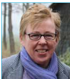
Rita Quartel Media & Resources