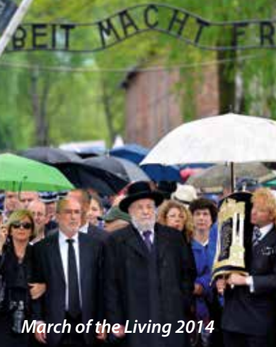
March of the Living 2014