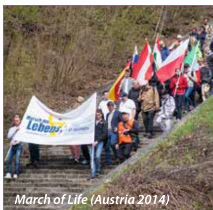
March of Life (Austria 2014)