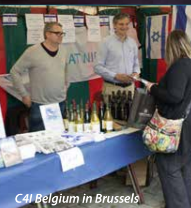
C4I Belgium in Brussels