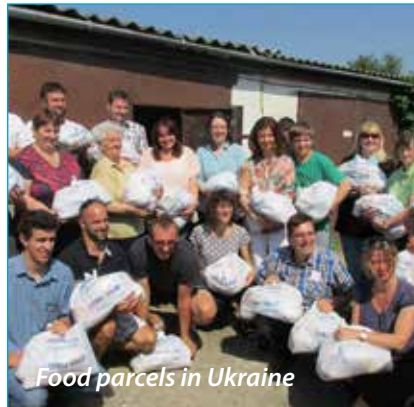
Food parcels in Ukraine