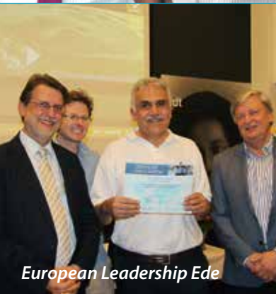
European Leadership Ede