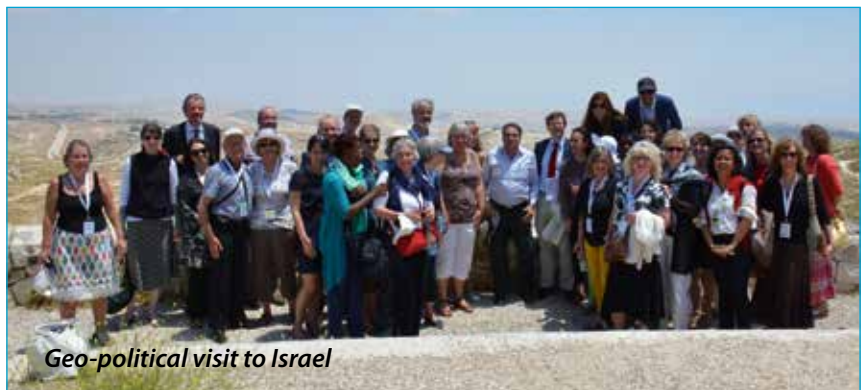
Geo-political visit to Israel