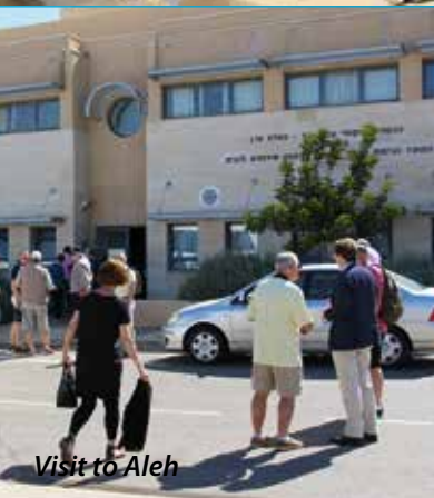
Visit to Aleh