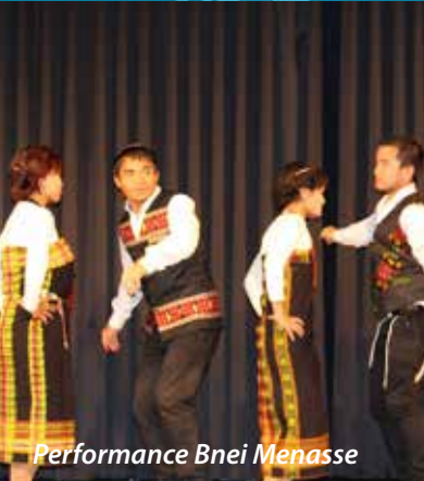
Performance Bnei Menasse