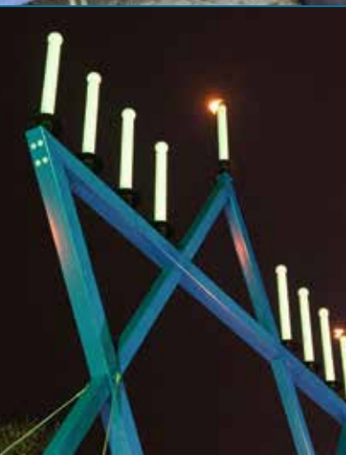
C4I Belgium in Brussels

participate in the March of the Living in Poland on April 28, 2014. The main purpose of this 3.5 km march from Auschwitz I to the Selection Point of Auschwitz-Birkenau was to proclaim: Never again! The March of the Living was followed by a very impressive Ceremony at Auschwitz to remember all those who perished during the Holocaust. Another group traveled to Poland to join the March of the Living on 16th of April 2015.