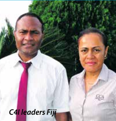
C4I leaders Fiji