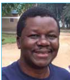
Drake Kanaabo East Africa