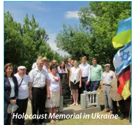
Holocaust Memorial in Ukraine