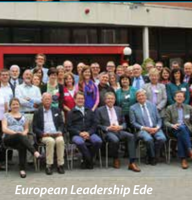
European Leadership Ede