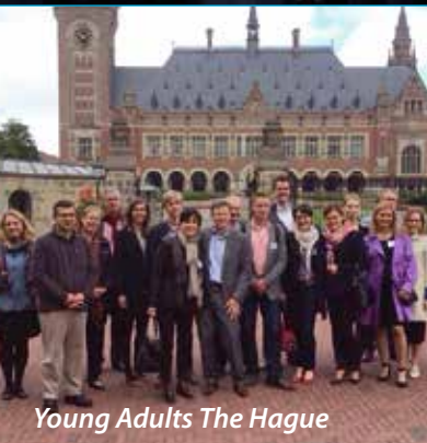
Young Adults The Hague