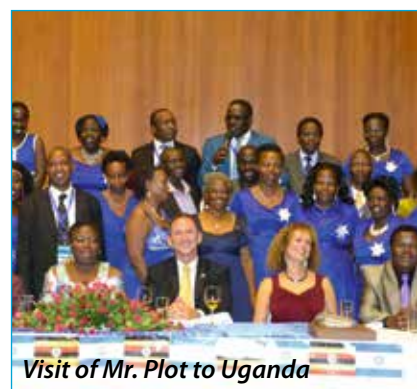
Visit of Mr. Plot to Uganda