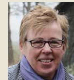
Rita Quartel Media and Resources